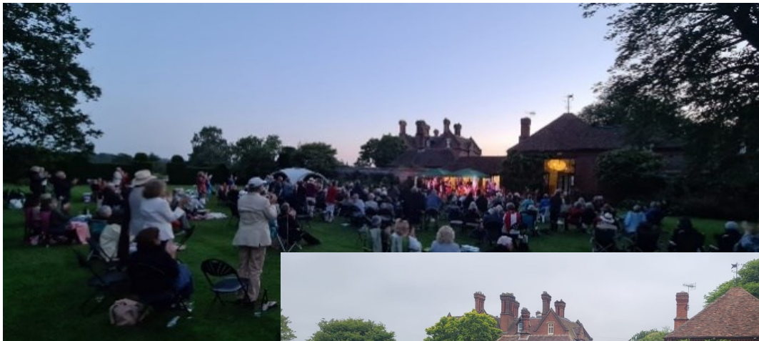
The second UK lockdown in the autumn 2020 also meant that none of the Autumn concerts ,

The major items to report therefore mirror, for the second time, the effect of the Covid-19 pandemic , notably, once again, including the much-reduced throughput of funds in Trust accounts for its first year but also, unfortunately, in the following as well as the current one on which we will report, hopefully with more promising results on 2023. This crimp on so much cultural activity and cross-cultural engagement, including ours, obviously derived from the virtual close-down of most forms of live music from March 2020. Initially this included the cancellation, well after it had been carefully programmed and organised, of the 2020 Musique-Cordiale International Festival & Academy , whose activities, musicians and students the Trust has supported over previous years. It then emerged that the 2021 and 2021 international Festivals would also have to fall victim to the same curtailment (and loss of optimism and opportunities for shared musicmaking across Europe, for which the Trust and its associated French non-profit Association Musique-Cordiale were founded and have always been dedicated).