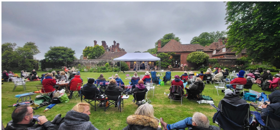
Summer 2022 Concert en pleine aire in Kent